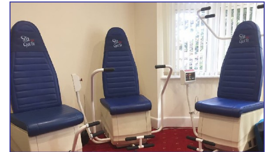
Power Assisted Exercise