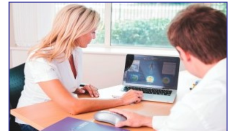
Nutri Energetic Scanning